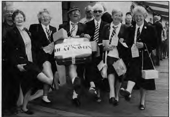
Fun at the evacuees reunion - De Bradelei Wharf Shopping Centre

After eight years of Festival events with, no doubt, almost a thousand activities how can you select a favourite? I have to say that