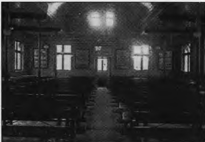
Inside the mission hall

made on the premises. The hats had to allow for her bun to show through. She bought her husband out of the army but 'they never lived together'. He drank a lot and always used a back door to avoid being seen returning from his drinking trips. He lived in one part of the building with his own servants and she in another (Nodd Ffa - House of Repair). She had ten well-to-do