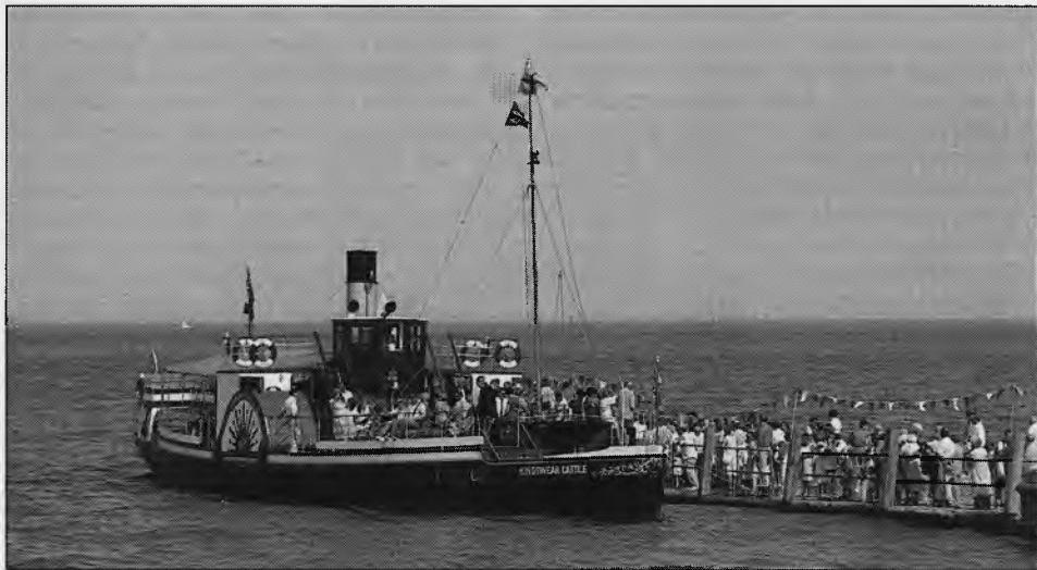
Paddle Steamer Kingswear Castle at Neptune Jetty, Sheerness

With passengers aboard we set sail down the Medway in search of the participants in the barge sailing match. This is what we had come to see. This annual sailing match brings together barges of various classes that had at one time or another been used for commercial trading up and down the coast. Now of course with the demise of sailing barges for commercial use, all the barges are privately owned. They have been carefully and lovingly restored and are sailed for pleasure. The facts given to us over the public address system illustrated only too vividly the decline over relatively few years of the barge numbers. Out of approximately 3000 barges built there are now under thirty in existence. The heyday of barge operations was in 1907 when 2070 sailing barges were working. By 1918 this had fallen to 1650. 1930 saw 1100 barges still trading. At the outbreak of World War II