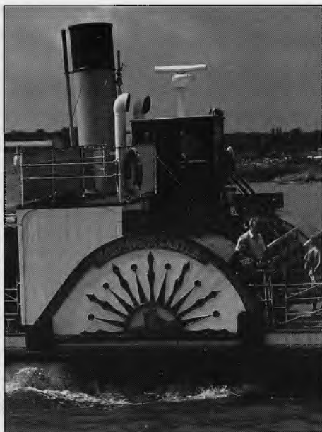
Paddle Steamer Kingswear Castle

Below Chatham Upnor Castle could clearly be seen. This is a 16 th . century fortification built to protect the dockyard., although the Dutch were still able to breach