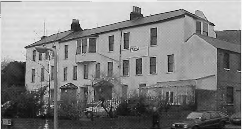
Prince of Wales House as it is today