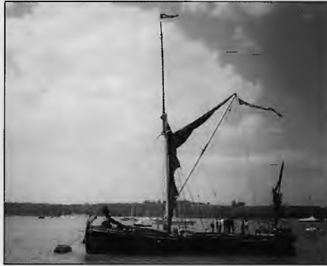
'Repertor' at the finishing post showing '1st across the line' pennant

the finishing line so that we were able to observe the first and subsequent barges cross the finishing line. The honour of being first went to the bowsprit class barge, "Repertor" with another bowsprit class barge, "Xylonite", following close on her heels. Over the next hour we were able to observe the remaining