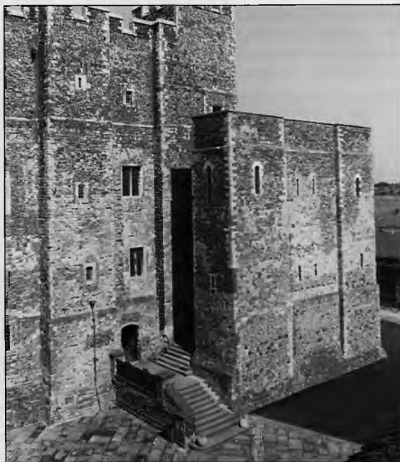
Fig. 2. The entrance to Maurice the Engineer's great keep at Dover Castle