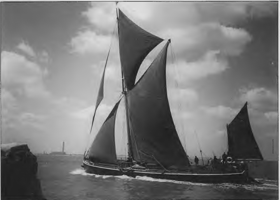
The 'Repertor', winning barge in the Bowsprit Class in the Annual Medway Barge Match, May 1999