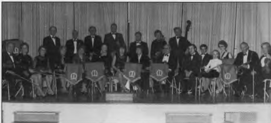
The Minerva Orchestra at a concert in St. Richard's School Hall in 1972