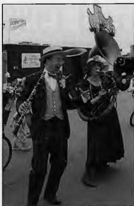
The Jelly Rollers in action at 'Beside the Seaside' festivities

Thursday evening finally arrived. The sky was crystal clear, the winds had dropped and the temperature rose (a little!). The performance from everyone involved was magical: from the impressive sculptures and haunting musical score, to the choreography, special effects and creativity of such a contemporary piece of work which the cast and crew had worked so hard to achieve.