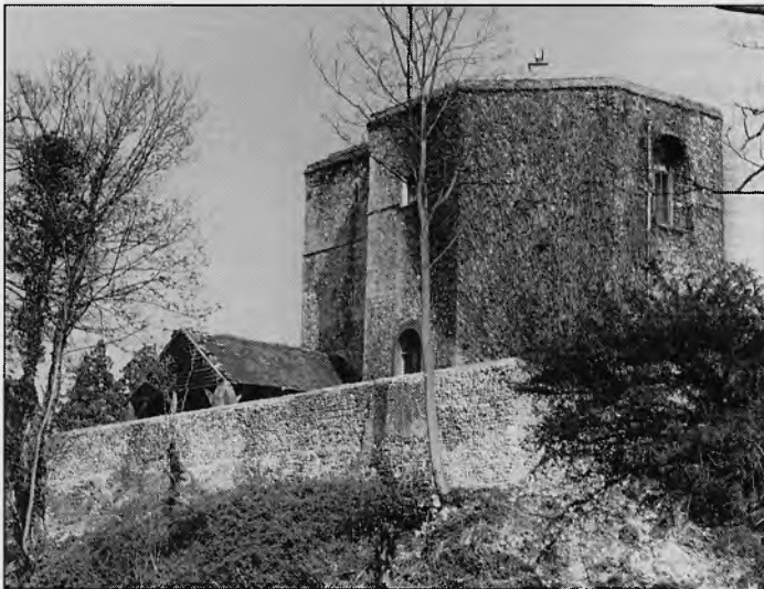
Fig. 3. The Surviving keep of Chilham Castle, with which Maurice was also involved.

from job to job, walking many miles sometimes right across Europe to new projects when their current ones were completed. Many masons were needed at Dover and they would have caused accommodation problems in the town because they always lived as a family group, with the master mason as their head, in the mason's lodge, a temporary structure beside the mason's floor and the work in which they were