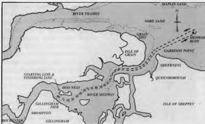
Course: from abreast Gillingham Pier to Medway Buoy and return - 29 miles