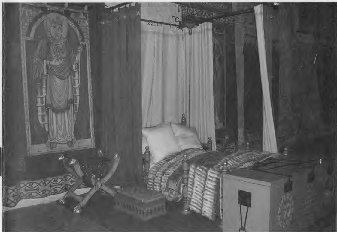
Restoration of Dover Castle, the main room