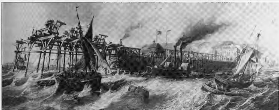
Construction of the Admiralty Pier

Then in 1897 Dover became one of the first towns to introduce trams. Three miles of track were laid and the penny fare proved to be very popular.