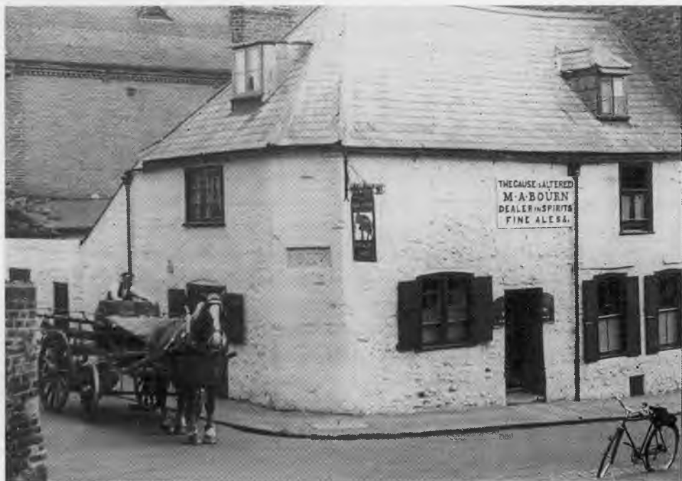
The Cause Is Altered