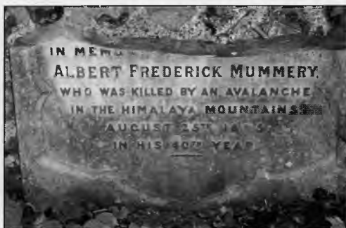
St Peter & St Paul churchyard

This article first appeared in the Dover Mercury and the Dover Society would like to thank them for the use of this story. Editor