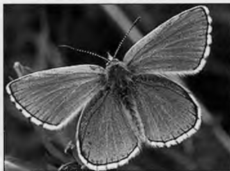
Adonis Blue (male)

"The Adonis Blue and Chalkhill Blue are attended by ants and the chrysalises actually sing to them. They are then taken down into the ants' nest where the ants suck the honey like fluid out of the chrysalis. Later the ants attend the emerging adult taking it to the surface, ready to dry its wings and take off," revealed Richard.