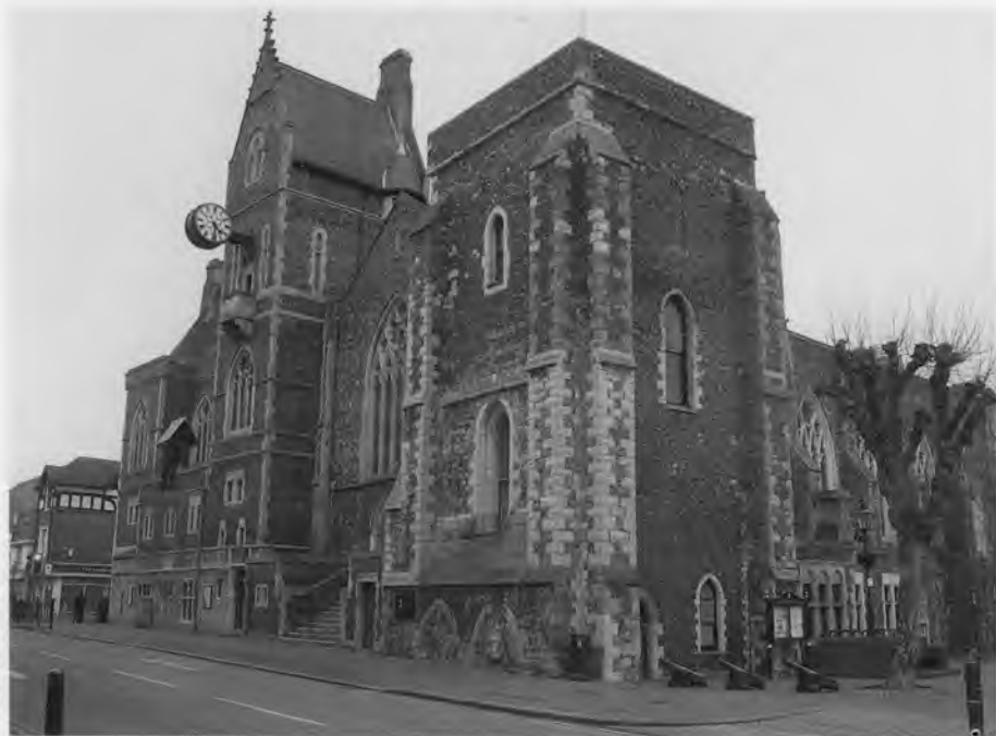
Dover Town Hall