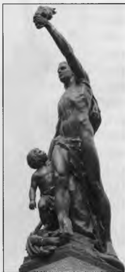
Kingston-upon-Thames Memorial

At the base is an explanation of the symbolism, "The bronze represents