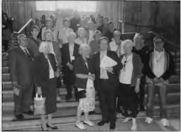
Dover Society members meet Charlie Elphicke at the Houses of Parliament

On to the Division Lobby and the interesting information from our guide that when the division bell rings there are eight minutes before the division doors are closed. I can recall in my younger days when I was working in London that in a certain pub there was a bell that summoned members back to the Division Lobby. Our guide confirmed that the pub I referred to still has a division bell to this day and I reckon at a brisk pace it is two minutes (subject to