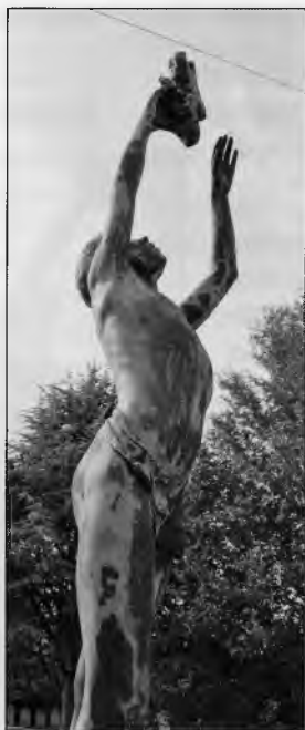
Youth at Newhaven Cemetery