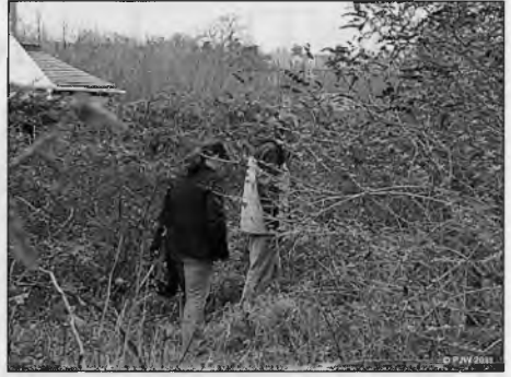
Cherry Tree scrapyard before....

LRCF has taken on the mantle of guardian in keeping what the area already has and building on it. That stems from the increasingly politically correct concept of 'Buy Local, Shop Local' that is championed daily by those who would have you vote for them or buy from them, to actively working to improve property and land where private landlords and landowners cannot afford to. Much has been made in the local Dover newspapers this year of the work carried out by LRCF volunteers in the