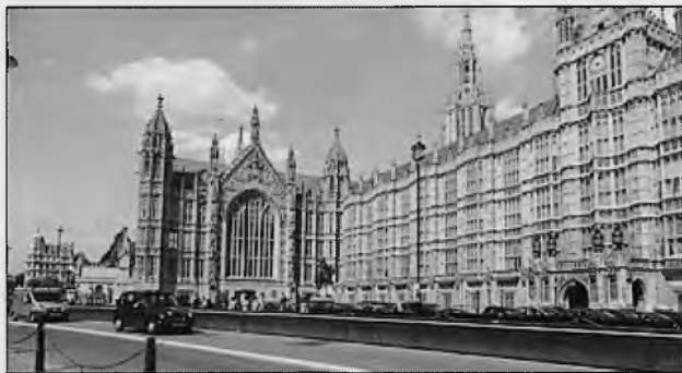
Houses of Parliament

took 16 years producing these, as painting was only done in the summer when the paint would dry on the wet plaster. In this room are magnificent carved bas-reliefs set into the panelling. The Chair of State is also in this room and it is here that the sovereign puts on the Imperial State Crown and