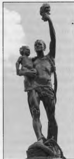
Redhill & Reigate Memorial