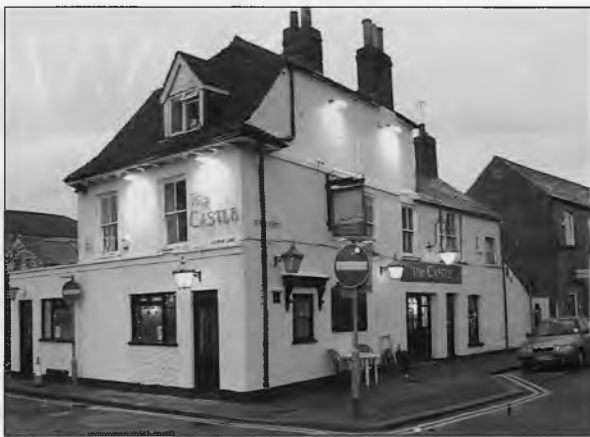
The Castle Inn

there, several young ladies remembered 'Hen nights' and the popular karaoke evenings at the Castle . I was also told that Cliff Richard and The Shadows used to frequent the Inn whilst playing at the Grenada and there is certainly evidence to show that Cliff Richard was top of the bill at the first stage show on April 25, 1960 after the Grenada was renamed the ABC. In recent years the Inn has fallen on hard times with the closure of the ABC Cinema, Southern Television Studios and the demolishing of much of the local area