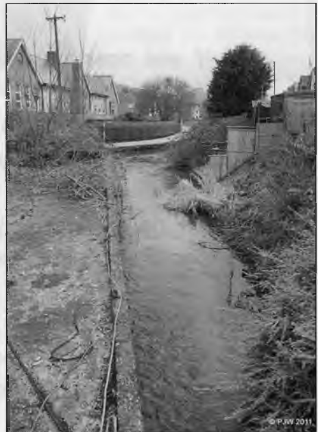
The River Dour

One concern is the poaching of fish. Anyone over 12 must hold a licence and members of the public should report any illegal fishing to the Environment Agency on 0800 807060. The better the quality of the river the more fish and the greater attraction to poachers.