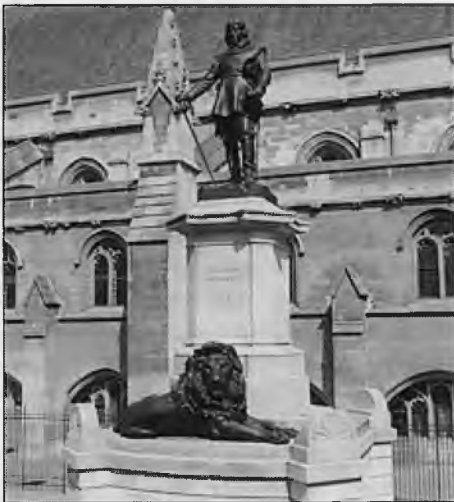
Statue of Oliver Cromwell