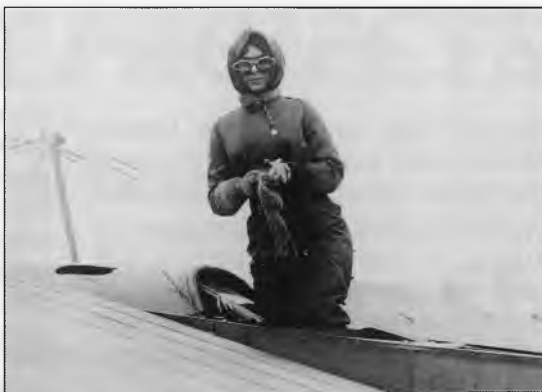
Harriet Quimby in the Blériot plane

Her next stop was Paris, where she placed an order with Blériot for a seventy-horse-power machine. At the same time, she persuaded Blériot to loan her a fifty-horse-power monoplane for the Channel crossing. Blériot agreed and suggested that the aeroplane should be first tried out from his airfield at Hardelot-Plage.