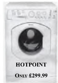
HOTPOINT ONLY £299.99