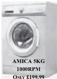
AMICA 5KG 1000RPM ONLY £199.99

REPAIRS TO VACUUM CLEANERS, MICROWAVES AND TOASTERS IN OUR WORKSHOP