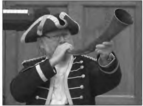
Burghmote Horn Blown at Tudor Festival 2016

As a result of extensive enquiries by Kent and London detectives two men were arrested and jailed. A few of the stolen items were recovered but not the historic horn. Since then insurance company detectives have been on the watch at