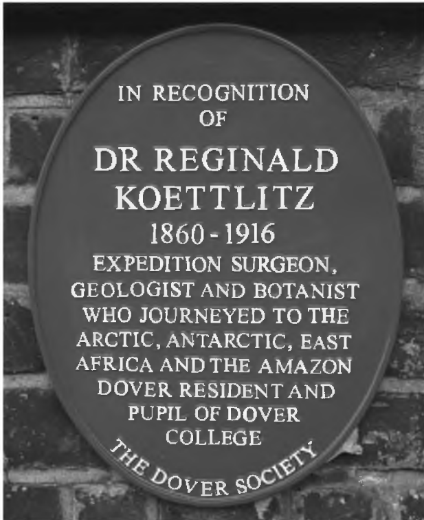
Koettlitz Plaque Old Gatehouse Dover College 5th Dec 2016