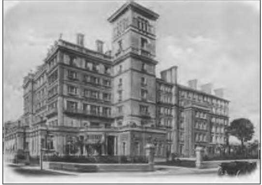
The Burlington Hotel

That's when Frederick Hotels stepped in, spent thousands of pounds on restoration and extensions before opening up as The Burlington. There were great expectations