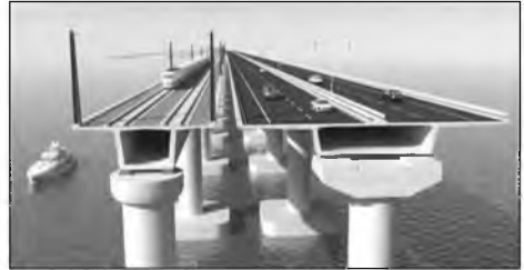
Proposed Qatar Bahrain Causeway 25 miles long

A third group, Channel Expressway, argued for a large multi-layered diameter road