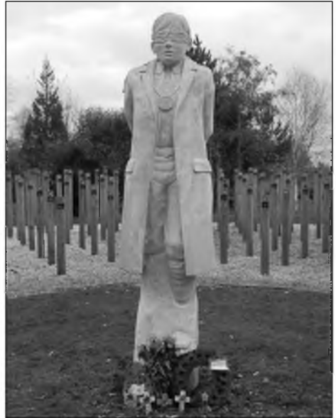
Shot At Dawn Monument, the National Memorial Arboretum in Staffordshire

They were interesting times. Dover has no military now.