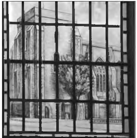
Dover St Marys East Window AK Nicholson 1955