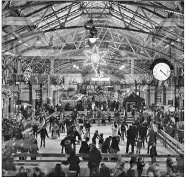
White Cliffs Christmas Skating - Cruise Terminal 2016

Following the apparent lack of action as reported in the last newsletter I am delighted that following a meeting with the Senior Enforcement Officer and his team at DDC things are back on track in particular properties in close proximity of the DTIZ area. We have always stressed that the Conservation Area next to the DTIZ should be maintained to a high standard.