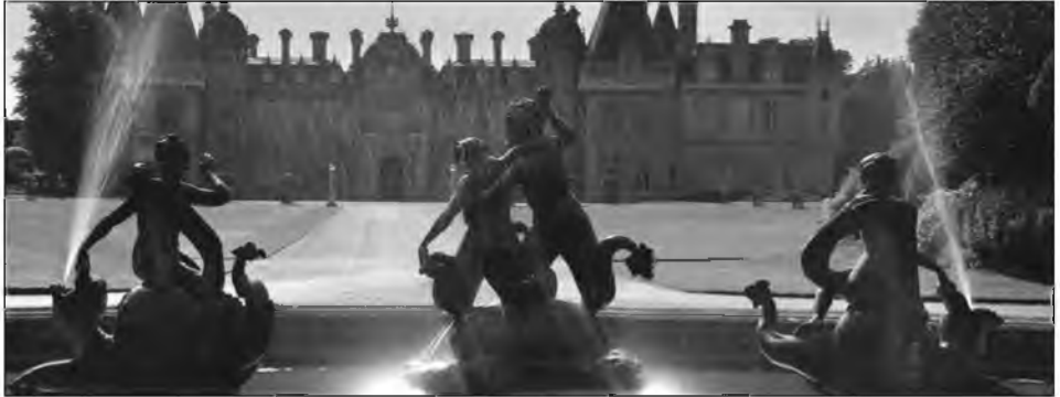
Waddesdon Manor - The North Avenue and Fountain

So what would you have done if you were 36 year old Baron Ferdinand de Rothschild, wealthy owner of numerous outstanding works of art, about to inherit a further fortune and art collection but your beloved wife and cousin Evelina had just died in childbirth and your son stillborn?