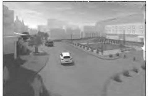
Drawings by Hartwell Architects © 2017 Dover Town Team