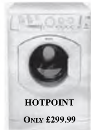
HOTPOINT ONLY £299.99