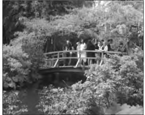
Japanese Bridge at Monet's Water Garden Giverny

Finally we joined the queue to enter the house. It was interesting to walk round the place where Monet had spent nearly 43 years of his life and died there in 1926. It is not a large house but seemed a very comfortable one. Paintings and pictures by Monet himself and other contemporary artists, presumably mostly reproductions, were displayed in every room. The furnishings were chosen to imitate what would have been there in Monet's time. In the large kitchen one wall was completely covered with a vast collection of copper cooking pots which were possibly originals as were the large cooking range and