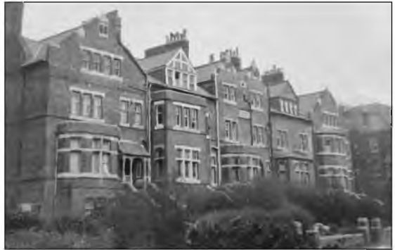
A truly massive terrace Leyburne Road, east side, late 1950s

Soon after I was born - in Fulmer Chase, near Burnham Beeches, a maternity hospital for naval wives, converted from a house which before the war had belonged to a tobacco king and after the war was burned down - we were evacuated to Pontllanfraith. "We" were me, my mother, and my grandmother. My aunt, who was a teacher, was billeted in the hills at Mynyddislwyn, with a black dog called Simba, and my grandfather, who in 1945 was to become the