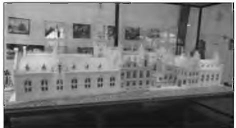
Benedictine Palace

Finally, after watching a video and observing the 27 herbs and spices which are used as ingredients in the closely guarded secret recipe, we were given a guided tour of the distillery. Suffice to say that the complicated process results in 3