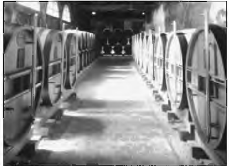
Chateau de Breuil Calvados Distillery Barrels

drove us to the calvados distillery of the Chateau de Breuil. Being rather naïve where alcohol is concerned, I was the only one in our group never to have tasted calvados. Apparently, I was in for a treat! Our charming French guide led us through the beautiful grounds to the magnificent Chateau built during the 16th and 17th centuries. Unfortunately, we were only allowed to view the exterior. The manufacture of calvados involves turning millions of apples each year into juice followed by natural fermentation, double distillation in copper stills and finally the ageing process. We went into the distillery where the distinctive calvados smell greeted us as we entered. After an explanation our guide took us to the Ageing Hall, formerly the servant's hall, where enormous barrels of calvados were