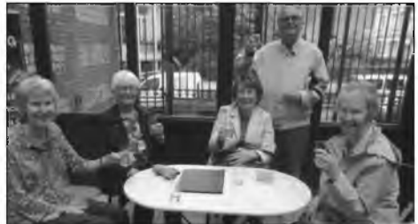
Benedictine Tasting