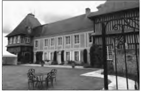
Chateau de Breuil Calvados Distillery

The Friday morning programme comprised two visits, both of which left me baffled for completely different reasons. First our excellent driver and guide, Ian,