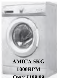
AMICA 5KG 1000RPM ONLY £199.99

REPAIRS TO VACUUM CLEANERS, MICROWAVES AND TOASTERS IN OUR WORKSHOP