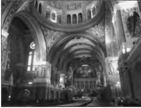
Ceiling Basilica Dedicated to Sant Therese of Lisieux

maturing. A surprise before we left the hall was a short but brilliant visual display of the whole process screened onto an end wall with its piles of casks: apple blossom, apples, distillation, ageing and bottling. The final stop was the testing room where everybody had the opportunity to taste two of the many different flavours and ages and, of course, the opportunity to purchase. So why was I baffled? After tasting, alcoholic philistine that I am, I wondered what all the fuss was about!