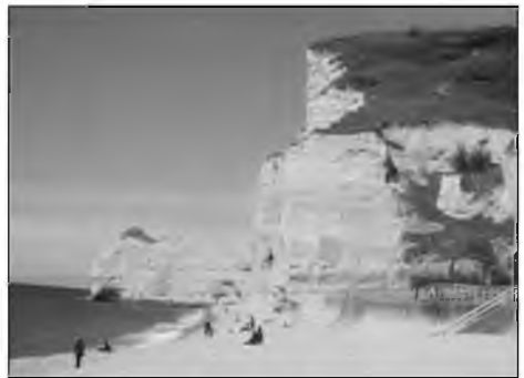
Beach at Étretat, Normandy, France

From Lisieux we made our way via Honfleur to Étretat. At Lisieux it had at one point bucketed down but now we were to enjoy the best of the day with plenty of sunshine. Thence across the Pont de Normandie we soon left the main road to make our way across country to our destination. It is a neat and tidy countryside with houses and gardens to match. No sheep to speak of but plenty of cattle, white and red and all mixtures in between - the source of all that lovely Normandy cheese. You have to park at the edge of the small town and walk to the