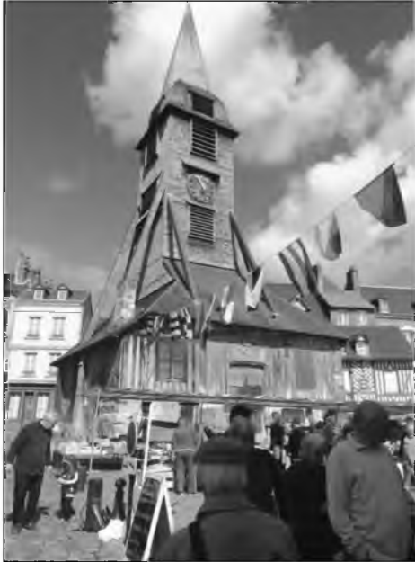
Le Vieux Bassin Market, Honfleur, France

A most beautiful sunny morning in Honfleur; Ian took us on a walk around the town and gave us an irreverent but very informative commentary. The old harbour and St. Catherine's Promenade sparkled in the sunshine but then Ian led us into the dark cobbled streets to the grim old prison past interesting shops and artists' studios