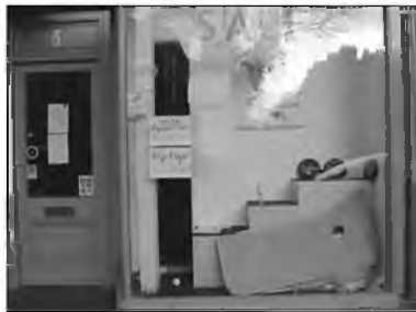
Dover Walk 4

English Channel. The pier, with its unique café, has been closed since I took some photos there – and the ambitious scheme for the Western Docks is now underway. I am sure we are all watching this new development with the greatest of interest.