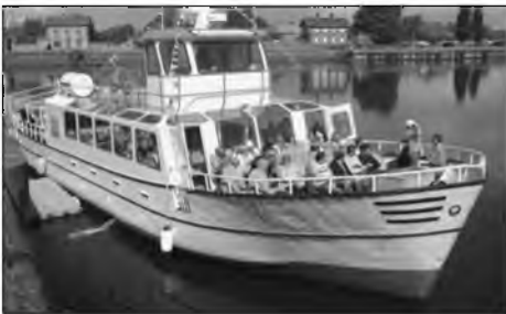
Honfleur Boat Trip