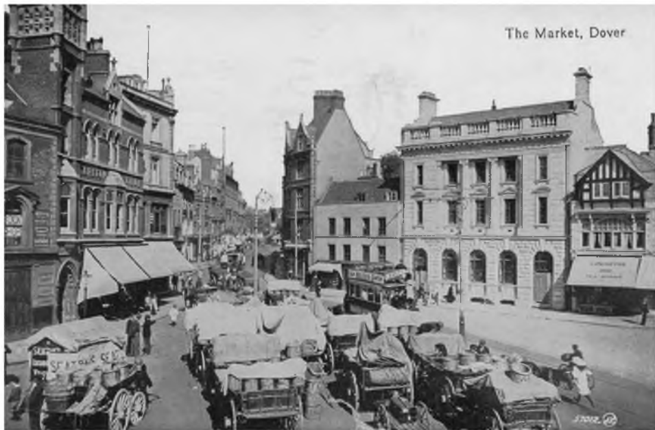
Market Square and Cannon Street