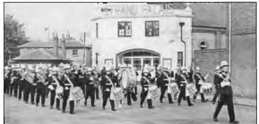
Royal Marines Band - Strand Palais Dance Hall, Walmer, Kent

The Royal Marine Heritage Trails – Deal and Walmer will be launched on 23rd April 2018 in both Deal and Dover in conjunction with the 100th Zeebrugge Day commemoration. The memorial to the fallen and the Zeebrugge Bell will be included in the trail.