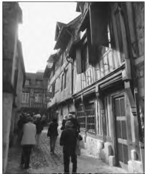
Old Street, Honfleur, France